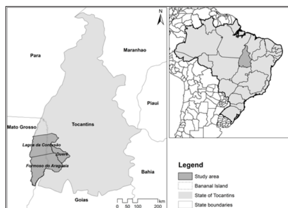
Figure 1 - Study area. The position of the three municipalities within the state of Tocantins and the border of the Bananal Island indigenous area on the left. The total area is 27,412 km 2 , (3,424 km 2 in Dueré, 13,423 km 2 in Formoso do Araguaia and 10,564 km 2 in Lagoa da Confusão), within which forest cover represents the 70% of the total area. The position of Tocantins within Brazil is on the right.

According to the Koppen classification, the climate is seasonal: the wet season is from October to March and the dry season from April to September (Klink and Machado 2005). The annual mean temperatures range from 22°C to 27°C and the annual rainfall from 1'300 to 1'900 mm (Alvares et al. 2013). In this fire dependent/influenced ecosystem (Hard-